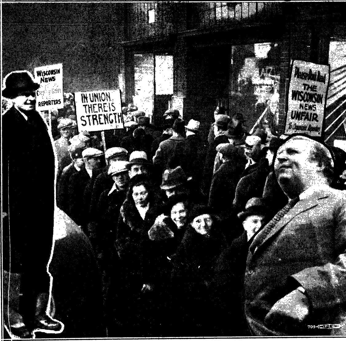
The strike of Newspaper Guild (union) members on the Hearst Wisconsin News is regarded as more than a mere economic matter. The people of Wisconsin are as eager to march in the line as the striking news writers themselves. It is reported that everyone who visits the city takes time for at least 10 or three turns around the building in line with the reporters. The strike is giving strength to the nation-wide boycott against the Hearst fascist press.

Striking Newspapermen Picketing Hearst's Wisconsin News