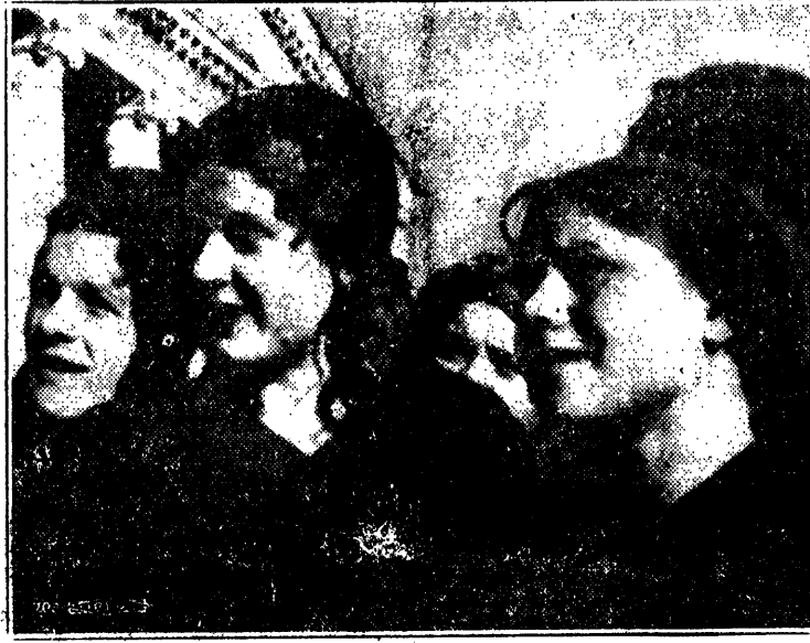
In from the collective farms to study at Moscow's theatrical schools, these two girls are admiring the newly-opened Moscow-Soviet hotel. Every time a school or theater shuts down in America, ten new ones open in the Soviet Union.

equipped with sound apparatus. Nevertheless, in the matter of cinema theatres and radio we are still far from satisfying the demand of the population and it is our duty to achieve greater progress in this field in the next few years.