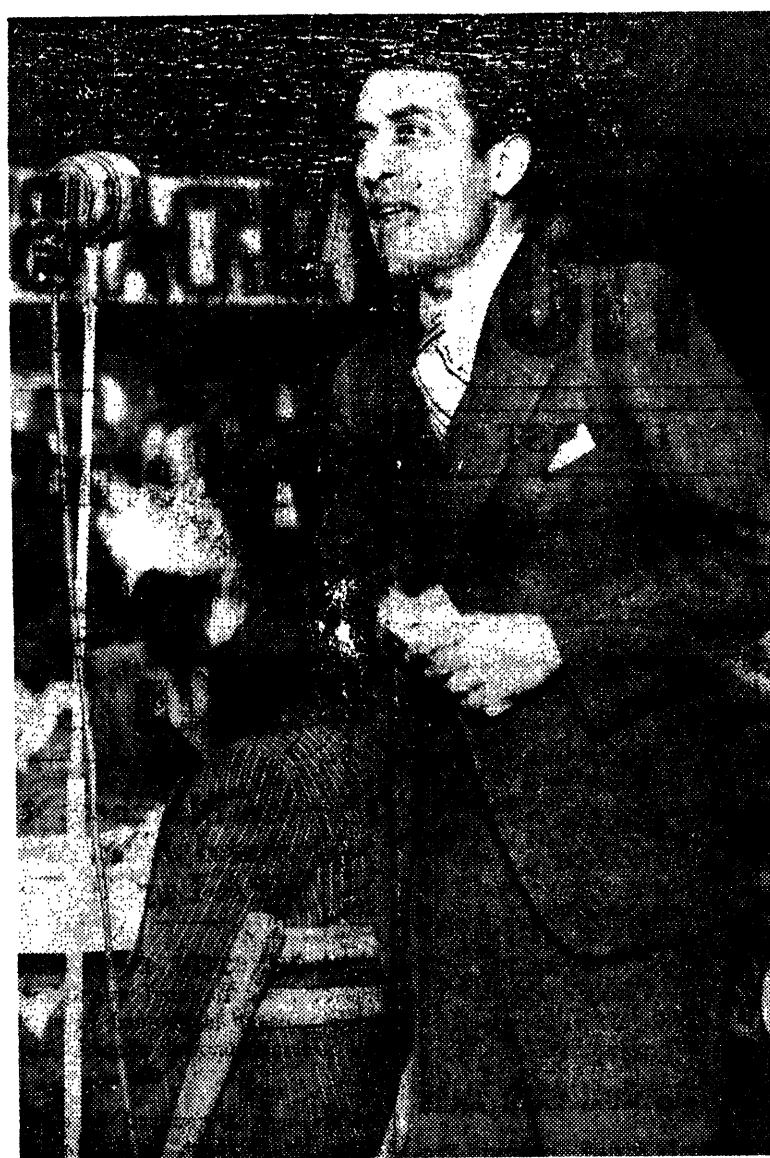
A brilliant orator, leader of the General Confederation of Workers and Peasants of Mexico, Lombardo Toledano is pictured above addressing the huge labor congress which opened in Mexico City on February 21. At this session was hammered out the great Confederation of Workers of Mexico, the united front of the organized Mexican workers and peasants. Toledano, whose headquarters were attacked recently by a hoodlum mob of reactionaries, was, until recently, a bitter enemy of the Communist Party. Of late he has apparently modified his opinions somewhat,—at least he understands the value of a united front.