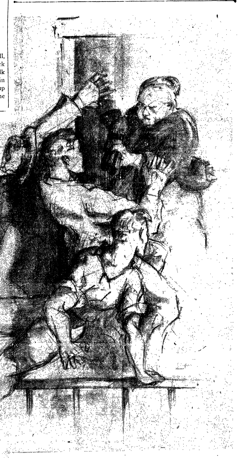
Its two ugly bores looked as merciless as the old lady's crackling eyes.

march out of here, in double-quick time." The one with the gun fidgeted threateningly. "Now don't try to get hard about it,—if you know what's good for you. We mean business."